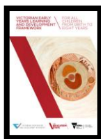
Victorian Early Years Learning and Development Framework

Approved learning framework: a guide which provides a vision for learning, pedagogical principles, practices and general goals or outcomes for children’s learning and how they might be attained. It provides a scaffold to assist educators to develop their own, more detailed curriculum relevant to their setting and the children and families attending. The Early Years Learning Framework V2 (Belonging, Being & Becoming) , the Victorian Early Years Learning and Development Framework and My Time, Our Place V2; Framework for School Age Care in Australia are approved learning frameworks for use in Victoria ( refer to Sources ).